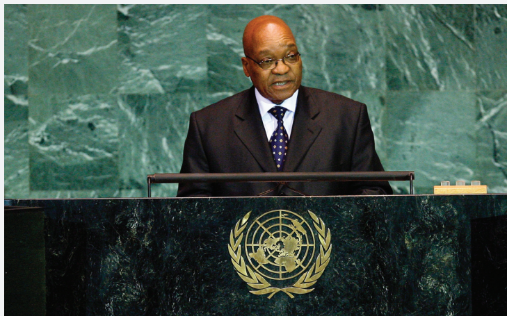
President Jacob Zuma at the United Nations