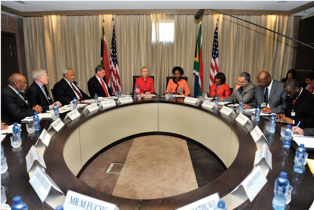
Minister Maite Nkoana-Mashabane with US Secretary of State Hillary Clinton