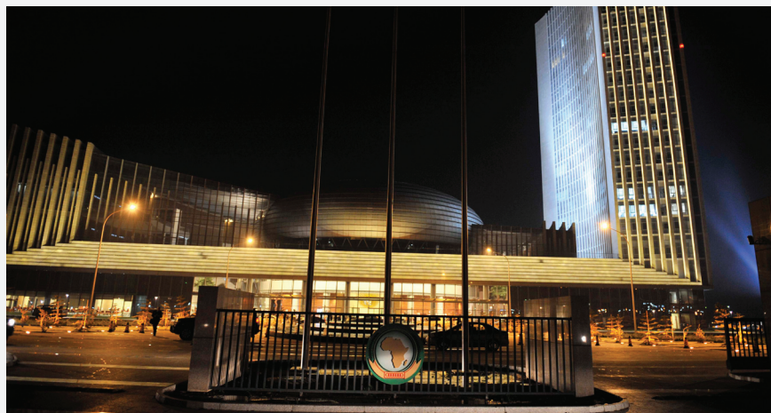
The African Union headquarters in Addis Ababa, Ethiopia