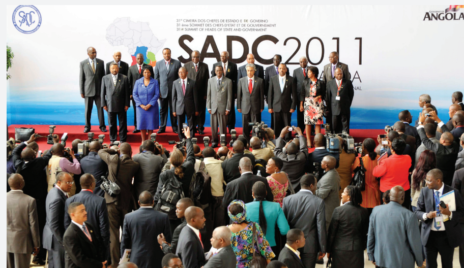
Leaders of SADC at the Summit in Angola, 2011