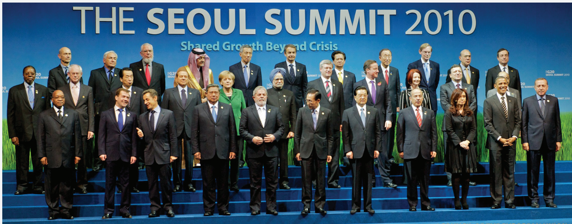
Leaders of G20 at the Seoul Summit 2010

G.10 A deputy leader of the delegation should in all cases be identified to assume responsibility in the absence of the leader of the delegation.