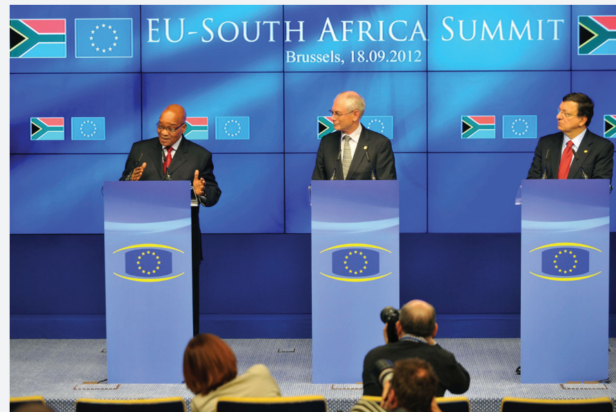
President Jacob Zuma with the President of the European Council, President Herman van Rompuy, and the President of the European Union (EU) Commission, President José Manuel Barroso, at the EU-South Africa Summit