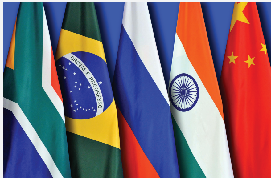
Flags of countries comprising the BRICS formation