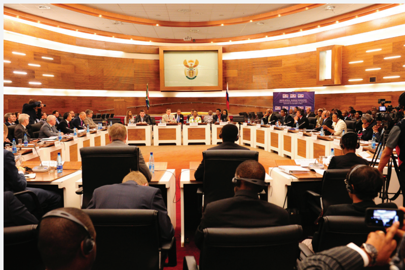
Minister Maite Nkoana-Mashabane addressing delegates at DIRCO's conference centre